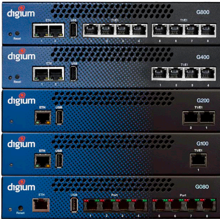
The Digium family of gateways

Deployed in any application, Digium gateways will provide proven reliability for a fraction of the cost of other gateway platforms on the market. They are easy to set up and include an API that reduces administration and troubleshooting costs for any organization, from a small business to a large enterprise.